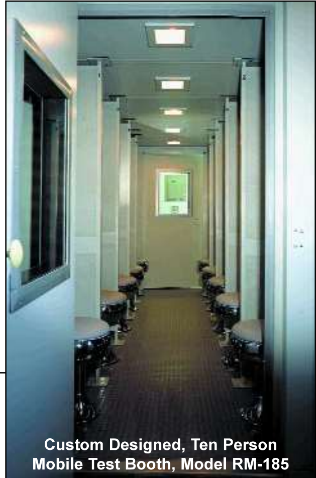
Custom Designed, Ten Person Mobile Test Booth, Model RM-185

Double wall booths provide increased isolation when ambient conditions prohibit a single wall configuration to meet ANSI specifications. Double wall booths also provide additional acoustic control to isolate patients from waiting room noise.